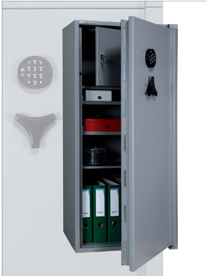
Fig. Safe BM35, hinge right E-Lock M-Locks EM3520, 1 inside locker, 2 pull-out shelves, 1 shelf