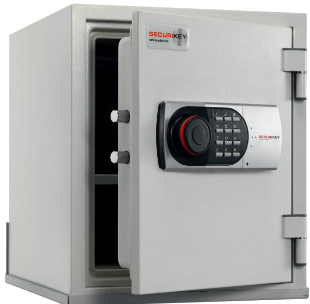
Fire Vault 1