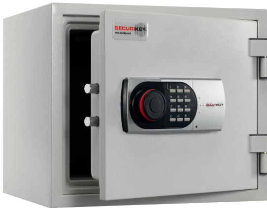
Fire Vault 0